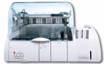
IDS-iSYS Multi-Discipline Automated System

For more information and products, visit www.euroimmun.com/products/